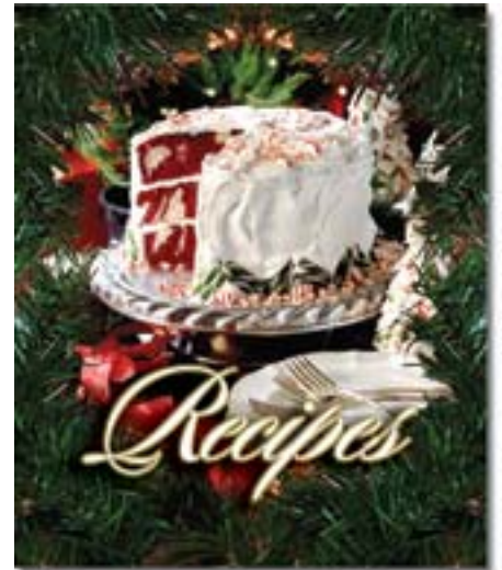
RECIPE 501 - Holiday