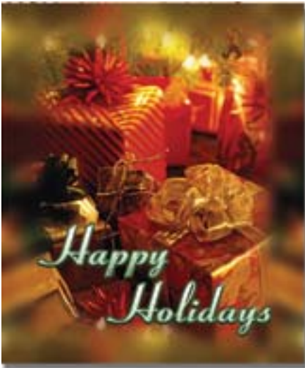
RECIPE 123 - Cutting Board